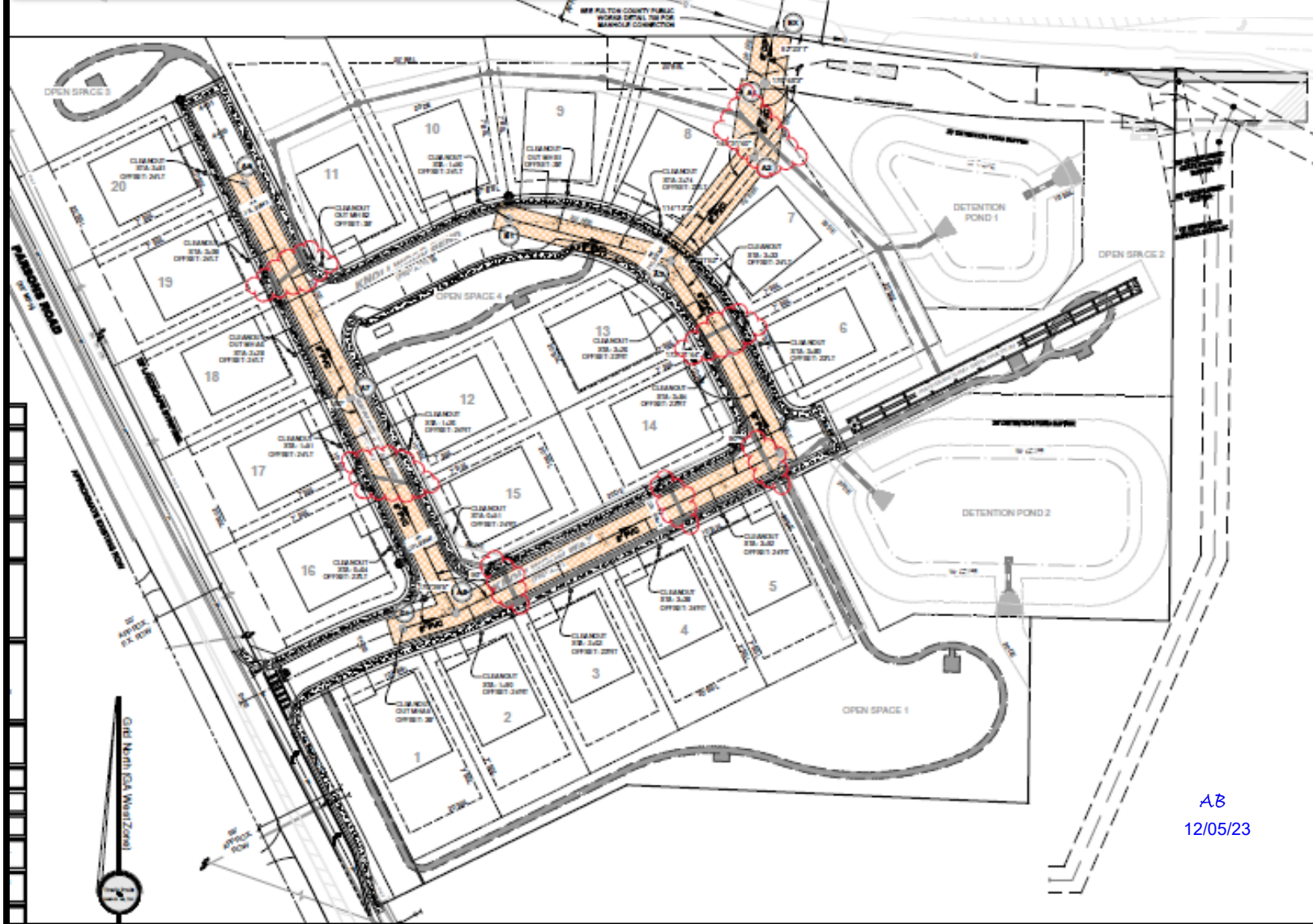
EXHIBIT A ENCROACHMENT AREA: 3400 SF/0.08 AC

6646 & 6666 ABBOTTS BRIDGE RD & 11346 PARSONS RD, LAND LOT 346 1ST DISTRICT, 1ST SECTION, CITY OF JOHN'S CREEK, FULTON COUNTY, GA 30068