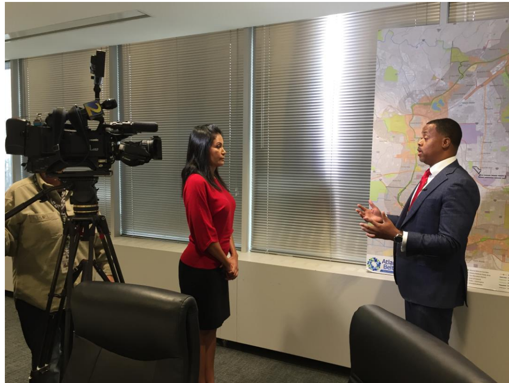
Pictured: interviews with WSB-TV and WABE