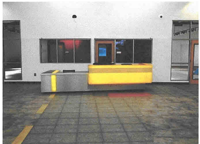
Receptionist Area from Main Entrance