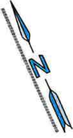
EXHIBIT A WATER LINE EASEMENT SCALE: 1"=50' GRANTOR: ARNOLD MILL FUEL, LLC PROJECT #WRN23-029