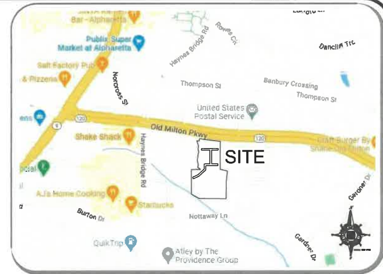
SITE MAP (NTS)