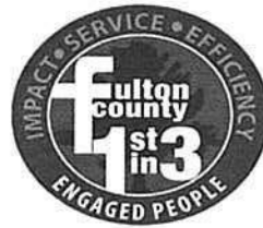
Exhibit 1: Board Grants Ratification Summary

Grants Submitted and/or Awarded May 1, 2017 Through May 31, 2017