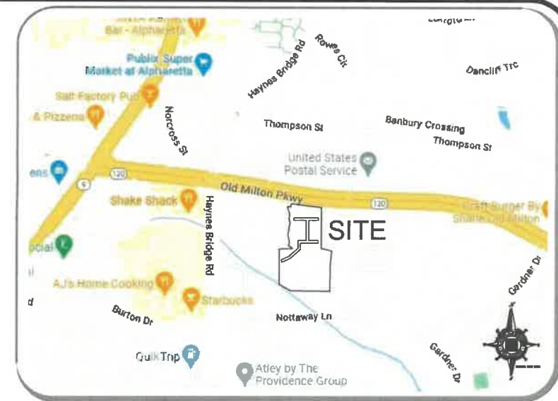
SITE MAP (NTS)