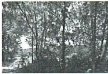
JGA CORP 452 SAWMILL DR, Suwanee GA 30024