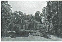
Carr Construction 775 Amberton Close, Suwanee GA 30024