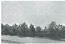
Factory Glass Direct 470 Satellite Blvd, Suwanee GA 30024