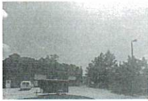
Georgia Outdoors Inc 360 Sharon Industrial Way, Suwanee GA 30024