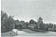
SUDS RESIDENTIAL WINDOW CLNNG 861 LAKEFAIRE LNDG, Suwanee GA 30024