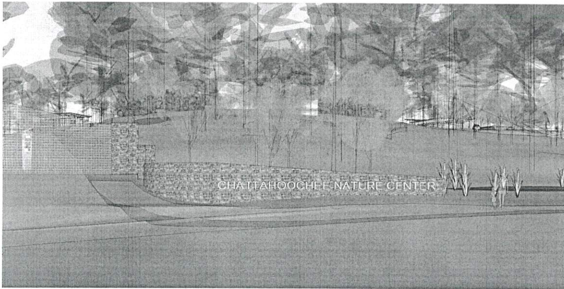
A low granite wall and signage increase visibility and create sense of arrival along Willeo Road. The low wall helps slow car traffic.

6. A copy of the results of the bid-process (who submitted estimates, the top 3 reviewed, and the one selected to complete the work) – Not yet available as the project is still in the design phase