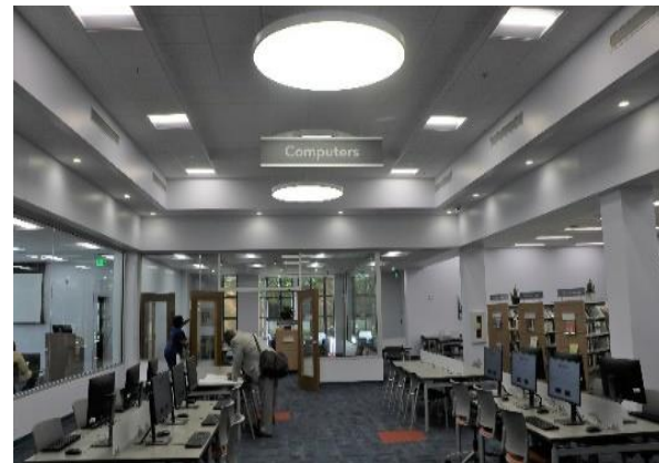
East Point Library – site fence