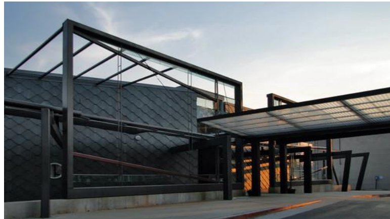
Buckhead Library – replace siding