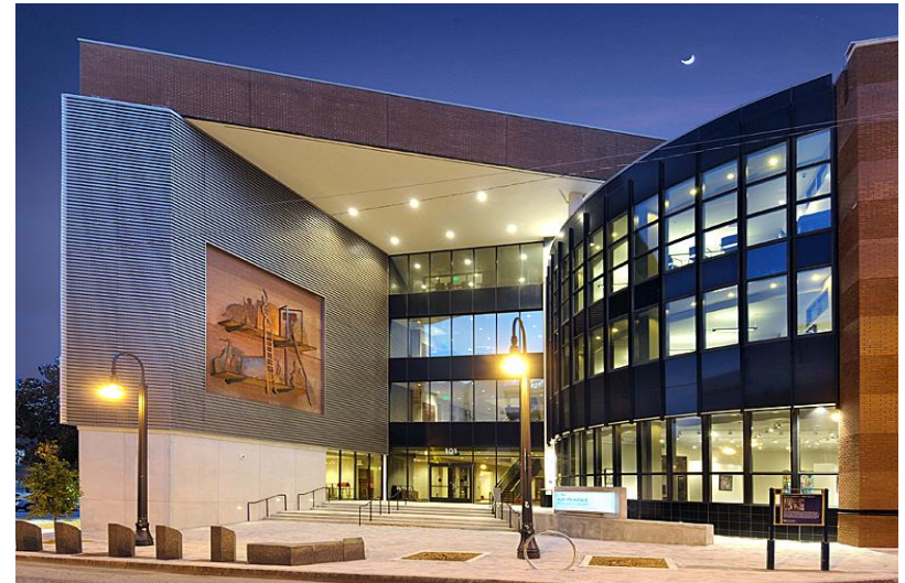
Auburn Avenue Research Library – site fence