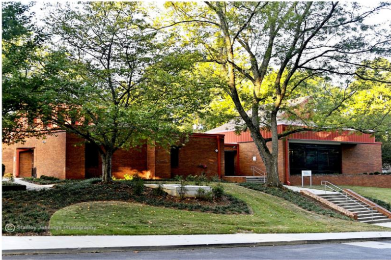
Fairburn Library – renaming