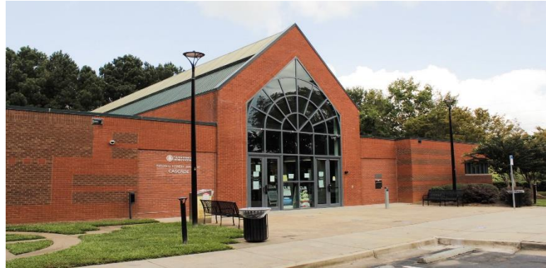
Cascade Library – new roof