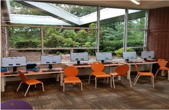
West End Library – add FF&E