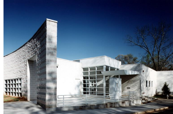
Cleveland Avenue Library – site fence