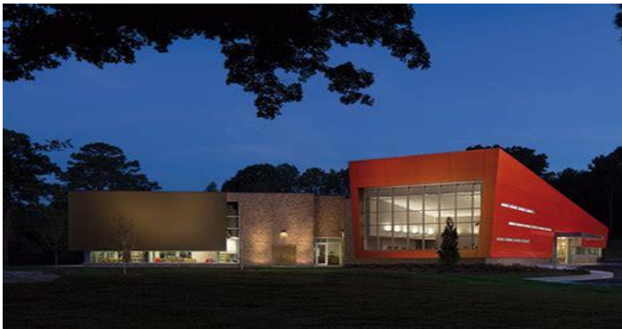
Wolf Creek Library – water infiltration