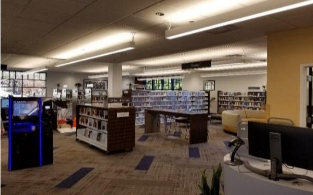
College Park Library - landscaping