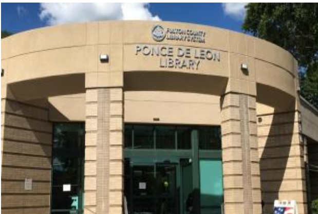
Ponce de Leon Library – site fence