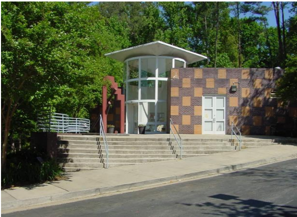
Northside Library – add canopy