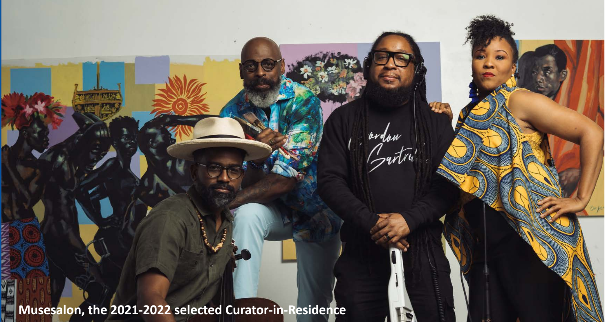
Musesalon, the 2021-2022 selected Curator-in-Residence

Artists have been selected for the upcoming 2021-2022 exhibition.